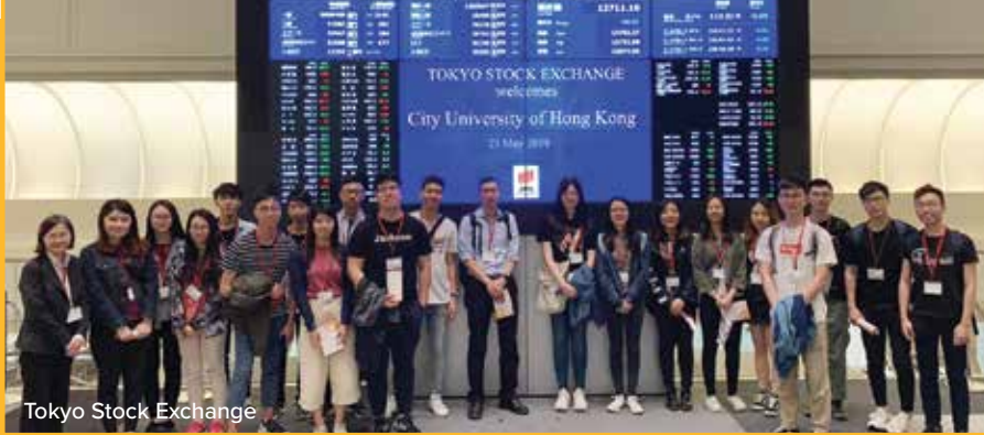
Tokyo Stock Exchange

“I had the opportunities to reach out to people from different professions and learnt what cannot be found from textbooks or lectures.”