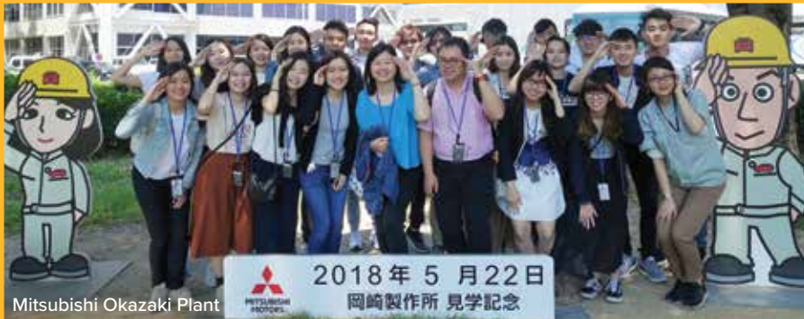
Mitsubishi Okazaki Plant

“I had the opportunities to reach out to people from different professions and learnt what cannot be found from textbooks or lectures.”